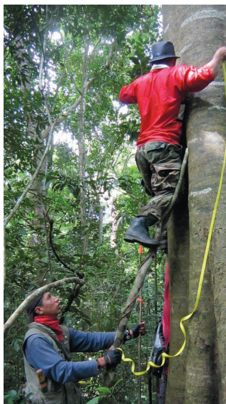
How big? Researchers go to great lengths to measure trunk diameters of surveyed trees.

At night, wearing headlamps, team members press leaf samples into old newspapers to store them intact for the trip back. They listen to Bolivian rock on a battery-operated MP3 player and tell bad jokes until they collapse onto their foam sleeping pads, anticipating a dawn wake-up call to repeat the day's activity.