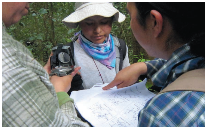
For the record. The location of each tagged tree is mapped and recorded for future visits.